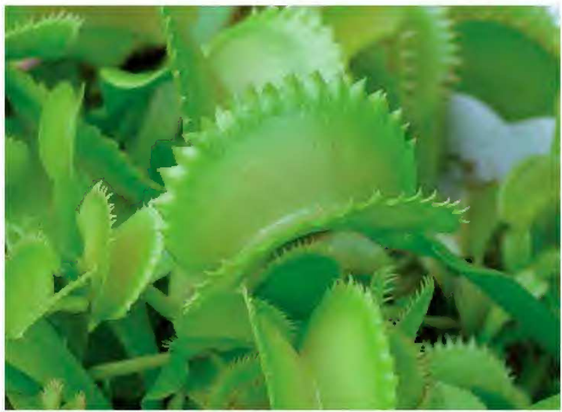
Figure 16: Parent plants of Dionaea 'Korean Melody Shark' from the UK informally named Dionaea "Shark Tooth".

We named this cultivar "Korean" because it came from Korea, where this new carnivorous plant cultivar has been named, "Melody" because the traps look like musical notes, and "Shark" as an allusion to the informal name of the parent plants.